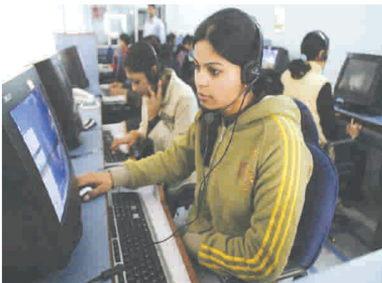
Fig. 8.1: Call Centre

The entertainment industry creates jobs to work in various print media firms, cable television channels. It is common to find internet cafes and public telephone