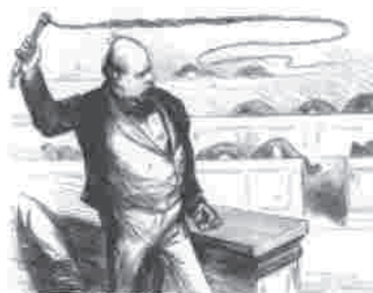
Caricature of Otto von Bismarck in the German reichstag (Parliament), from Figaro , Vienna, 5 March 1870.

This can be observed in the process by which Germany and Italy came to be unified as nation-states. As you have seen, nationalist feelings were widespread among middle-class Germans, who in 1848 tried to unite the different regions of the German confederation into a nation-state governed by an elected parliament. This liberal initiative to nation-building was, however, repressed by the combined forces of the monarchy and the military, supported by the large landowners called junkars of Prussia.