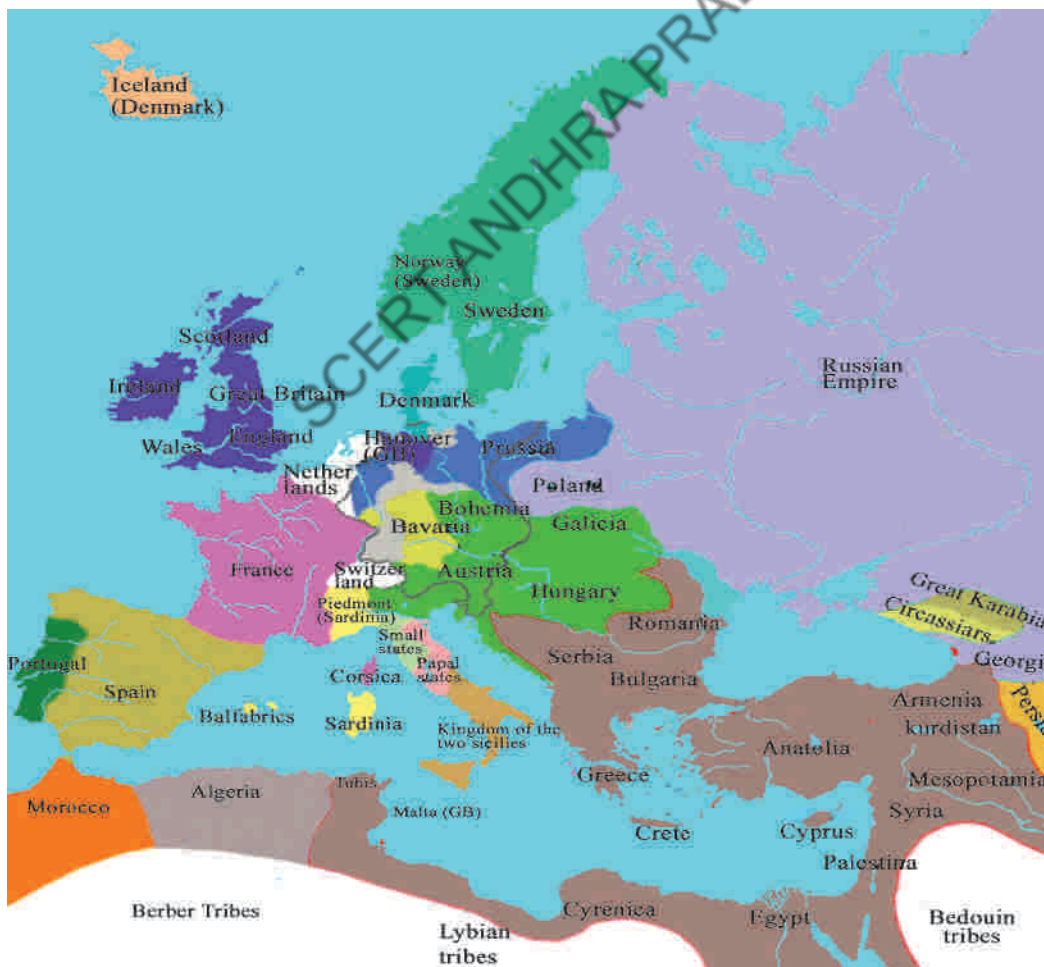
Map 1: Europe after the Congress of Vienna - 1815.

The concept and practices of a modern state, in which a centralised power exercised sovereign control over a clearly defined territory, had been developing