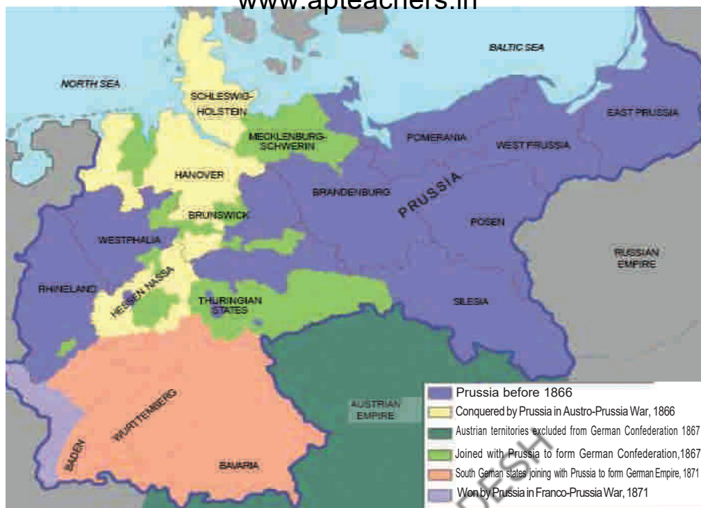
Map 2: Unification of Germany (1866-1871)

From then on, Prussia took on the leadership of the movement for national unification. Its Prime Minister, Otto von Bismarck, was the architect of this process carried out with the help of the Prussian army and bureaucracy. Three wars over seven years – with Austria, Denmark and France – ended in Prussian victory and completed the process of unification. In January 1871, the Prussian king, William I, was proclaimed German Emperor in a ceremony held at Versailles.