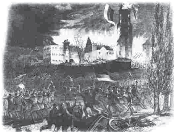
Fig. 14.3: Peasants' uprising, 1848.

or a year of bad harvest led to widespread pauperism in town and country.