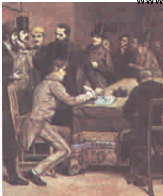
Fig. 14.6: Giuseppe Mazzini and the founding of Young Italy in Berne 1833. Print by Giacomo Mantegazza.

called Young Italy for the dissemination of his goals. The failure of revolutionary uprisings both in 1831 and 1848 meant that the mantle now fell on Sardinia-Piedmont under its ruler King Victor Emmanuel II to unify the Italian states through war. In the eyes of the ruling elites of this region, a unified Italy offered them the possibility of economic development and political dominance.