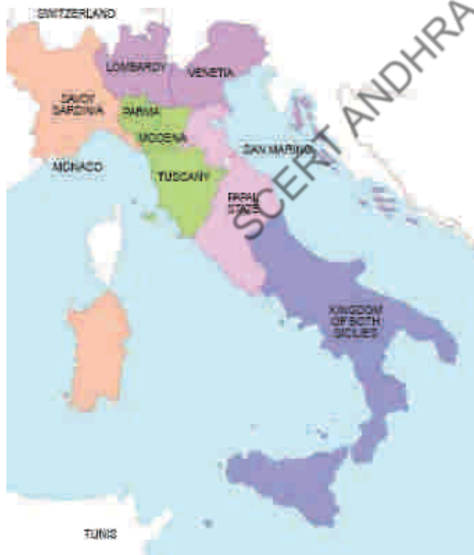
Map 3: Italian States before Unification 1858.

South Italy and the Kingdom of the Two Sicilies and succeeded in winning the support of the local peasants in order to drive out the Spanish rulers. In 1871 Victor Emmanuel II was proclaimed king of united Italy. However, much of the Italian population, among whom rates of illiteracy were very high, remained blissfully unaware of liberal nationalist ideology. The peasant masses who had supported Garibaldi in southern Italy had never heard of Italia, and believed that 'La Talia' was Victor Emmanuel's wife!