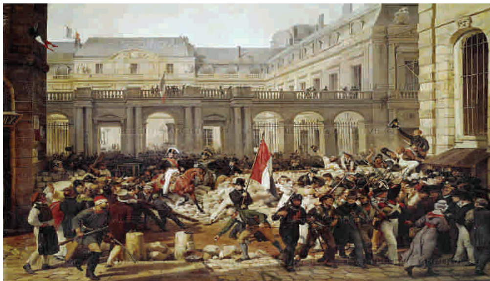
Fig. 14.4: The revolting French people in Paris.

The revolt spread to Poland, most of which had been given to Russia by the Congress of Vienna. The Polish situation was different from that of Belgium because it involved Russia, one of the great powers. The Poles received no help from their neighbours, and though they fought hard, they were defeated. As a result, the Tsar made Poland a part of Russia. Hundreds of Poles were put to death and everything possible was done to wipe out all national spirit among them.