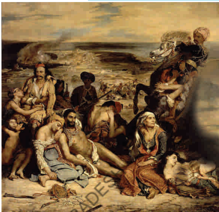
Fig. 14.2: The Massacre at Chios , Eugène Delacroix, 1824.

The emphasis on vernacular language and the collection of local folklore was not just to recover an ancient national spirit, but also to carry the modern nationalist message to large audiences who were mostly illiterate.