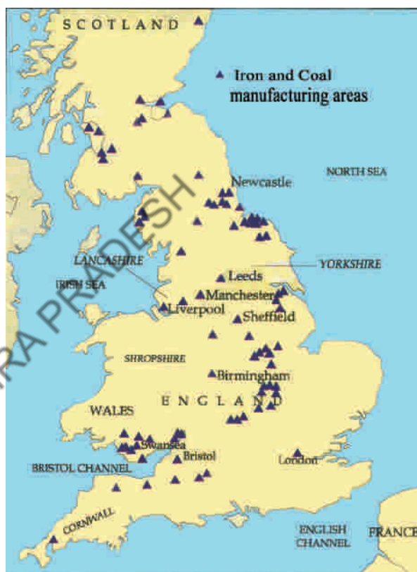
Map 1: Britain(England): The Iron Industry

But, mere availability of wealth is of no use, unless it is invested in the right way. The part played by the Bank of England in speeding of the use of capital is in no way to be underestimated. The rise of London money market, joint-stock banks, and Joint Stock Corporation made the finance simple and easy.