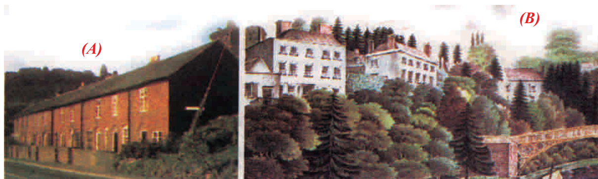
Fig. 15.4: (A) Coalbrookdale, Carpenters' Row, cottages built by the company for workers in 1783; (B) The houses of the Darbys; painting by William Westwood, 1835.

There was, at the same time, a massive negative human cost. This was evident in broken families, new addresses, degraded cities and appalling working conditions