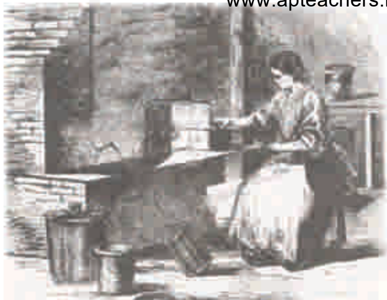
Fig. 15.5 : Woman in gilt-button factory, Birmingham. In the 1850s, two thirds of the workforce in the button trade was women and children. Men received 25 shillings a week, women 7 shillings and children one shilling each, for the same hours of work.

were often employed in textile factories because they were small enough to move between tightly packed machinery. The long hours of work, including cleaning the machines on Sundays, allowed them little fresh air or exercise. Children caught their hair in machines or crushed their hands. Some died when they fell into machines as they dropped off to sleep from exhaustion.