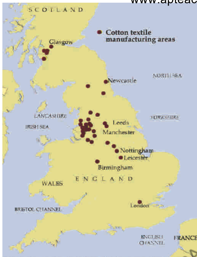
Map 2: The cotton industries in Britain.

between the speed in spinning raw cotton into yarn or thread, and of weaving the yarn into fabric. To make it even more efficient, production gradually shifted from the homes of spinners and weavers to factories.