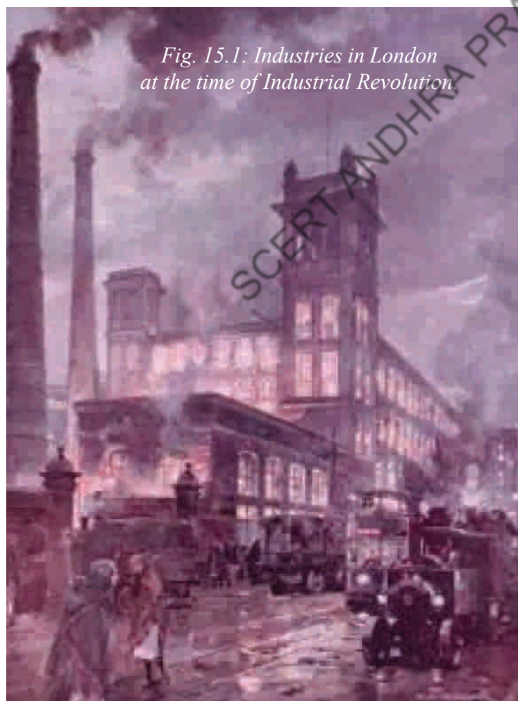
Fig. 15.1: Industries in London at the time of Industrial Revolution.

This early phase of industrial development in Britain is strongly associated with new machinery and technologies. These made it possible to produce goods on a massive scale compared to handicraft and handloom industries. This chapter