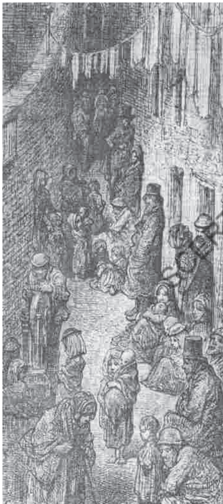
Fig. 16.1: Lane in poorer quarters of London. French artist Dore 1876.

Industrialisation also deeply troubled artists and intellectuals. Human values associated with agricultural or craft production and community life of villages were lost. The overwhelming emphasis on reason and science and technology rather than feelings and emotions, the awesome impact of large scale industrialisation coupled with the squalor and poverty in which the working people lived – left deep mark on the thinking of the people. Some of them studied economics and social history to understand the challenges of industrialisation. Others turned to poetry and art for inspiration for alternative virtues.