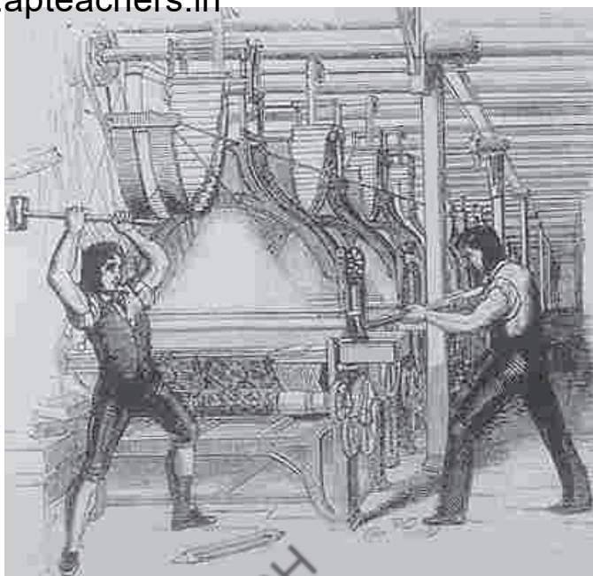
Fig. 16.2: An illustration from 1812 named Frame Breaking showing Luddists .

Some elements of socialist ideas can be seen in many thinkers down the ages, like Plato or Thomas Moore. These ideas became powerful when they were