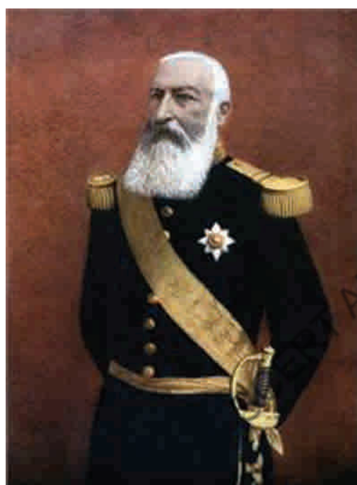
Leopold - II

territories grew up to 2,300,000 square kilometres, about 75 times larger than Belgium. It was called the Congo Free State. Léopold II personally owned the colony and used it as a source of ivory and rubber. The Congo Free State imposed a reign of terror on the colonised people, including mass killings and forced labour. Each person in the village was forced to supply a quota of rubber and the hands of those who didn’t fulfill this quota was cut off. Up to eight to ten million of the estimated 16 million native inhabitants died between 1885 and 1908. Leopald amassed a huge fortune a part of which he used to undertake many building activities in Belgium. There was much public criticism of this all over the world including Belgium and the Belgian government was forced to finally end the personal rule of its king over Congo and bring it under the rule of the Belgian Parliament.