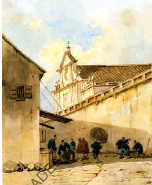
Fig. 17.6: Watercolour on paper titled 'Macao street scene' from 1840. Macao was one of the port cities in China where Europeans were allowed to conduct trade.

sold there. In return the Europeans purchased silk and tea which they sold in Europe. In this way they did not have to pay the Chinese in silver. As the smuggling of opium increased, the Chinese authorities suspended all trade with European traders even in the one city they had allowed it. This led to what are called the Opium Wars which were fought between China and England which was supported by the other European powers between 1839-42, 1857-58 China was defeated by England which imposed a series of unequal treaties. These treaties allowed England to trade with china without restrictions and allowed the English to establish trading enclaves in China in which only English laws could be in force. England also forced China to give it the most favoured nation treatment, by which any concession given to any other country would be automatically apply to England too.