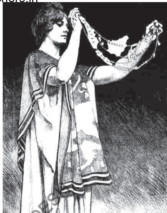
Fig. 17.4: Dutch imperial imagery representing the Dutch East Indies (1916) The text reads Our most precious jewel.

The government finally ended the system of forced delivery of produce in 1870. It now encouraged Dutch capitalists to invest in Indonesia to set up 'plantations' in which a single crop (like rubber, pepper or sugarcane) was extensively planted and managed by Dutch planters. The Dutch introduced coffee, tea, cocoa, tobacco and rubber and large expanses of land became plantations. The plantations were worked by semi-servile workers under overseers. Many of them were even brought from distant countries like India. The produce of the plantations were sold by the owners in international markets especially in Europe. They also invested in mining tin and petroleum. To facilitate the transport of these goods the government invested heavily in railway, as well as telegraph lines etc. The Dutch Indonesia produced most of the world's supply of quinine and pepper, over a third of its rubber, a quarter of its coconut products, and a fifth of its tea, sugar, coffee, and oil. The profit from the Dutch East Indies helped Holland to develop industries and made it one of the world's most significant colonial powers. This power was ended by Japan during the second World War between 1939-45. Indonesia became independent after the world war along with India.