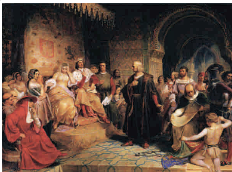
Fig. 17.1: Columbus before the Queen, as imagined by Emanuel Gottlieb Leutze, 1843.

Not to be left behind the English landed in North