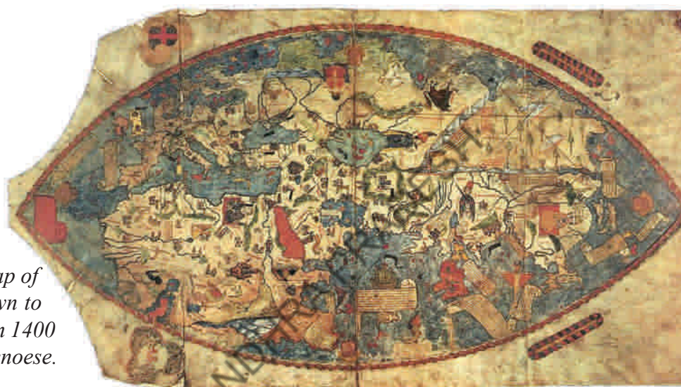
Map 1: Map of world known to Europeans in 1400 known as Genoese.

Look at the map of the world given below. It shows the world as known to the Europeans some 600 years ago.