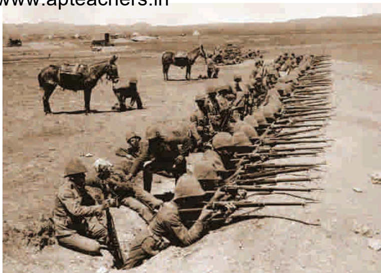
Fig. 17.7: Boer war.

over the area, the Boers were dissatisfied and migrated to new areas and even established independent republics. When gold and diamond mines were discovered in those parts (1869 and 1886), a large number of people from Europe and Africa and India migrated to South Africa and wanted to gain from the mining boom. The British government now wanted to end the independence of the Boers and establish British power