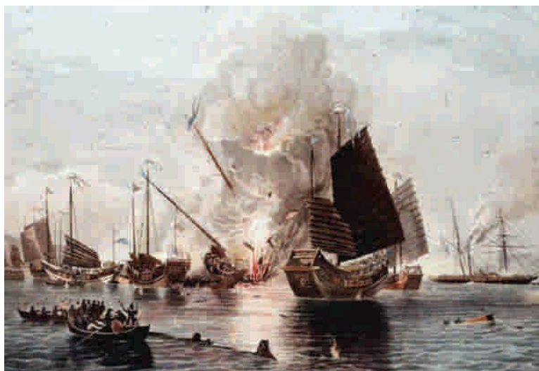
Fig. 17.5: British navy in the first Opium war.

metals from Europe. The European traders hit upon an item which was in great demand in China but was produced in India. This was opium. The English encouraged Indian peasants to produce large quantities of opium and purchased it from them at very low prices. This opium was smuggled illegally into China and