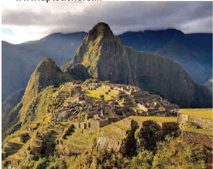
Fig. 17.3: An Inca site of worship known as Machu Picchu in today's Peru

By 1820s United States of America had emerged as a major economic and political power. It began to regard the South America as a sphere of its influence and actively discouraged any European power to establish control over this area. The President of USA