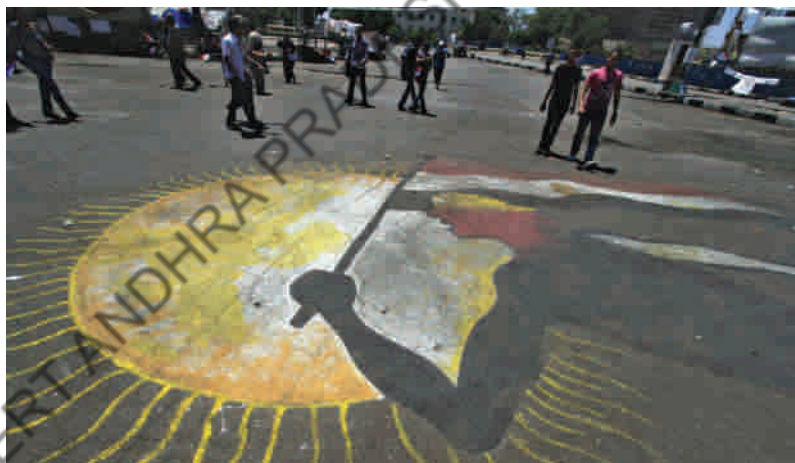
Fig. 19.2: A street painting in Egypt another country where democratic movement occurred during this decade.

In the latter half of 2010 there were movements to establish democratic governments across the Arab world. It began with a small country Tunisia and spread to Egypt, Libya, Yemen, Bahrain and Syria amongst others. This revolutionary wave of demonstrations, protests, and wars occurring in the Arab world that began in December 2010 is now famous as the ‘Arab Spring’.