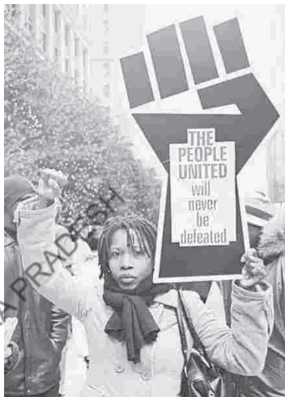
Fig. 19.1: Peoples' protest