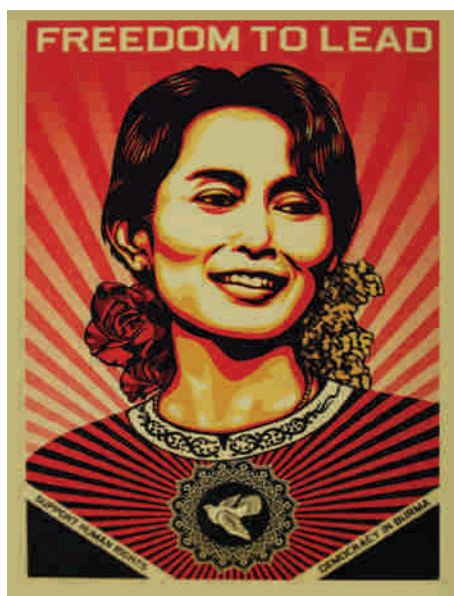
Aung San Suu Kyi: A poster from Myanmar supporting Democracy.

The rulers declared elections in 1990. In this election a new political party