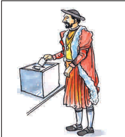
Fig. 20.1: You can vote if you pay tax