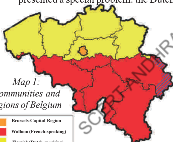
Map 1: Communities and regions of Belgium

The minority French-speaking community was relatively rich and powerful. This was resented by the Dutch speaking community. This led to tensions between the Dutch-speaking and French-speaking communities during the 1950s and 1960s. The tension between the two communities was more acute in Brussels. Brussels presented a special problem: the Dutch-speaking people constituted a majority in the country, but a minority in the capital.