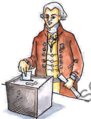
Fig. 20.2: You can vote if you are educated