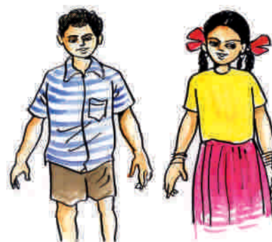
Fig. 20.5: You can't vote because you are too young