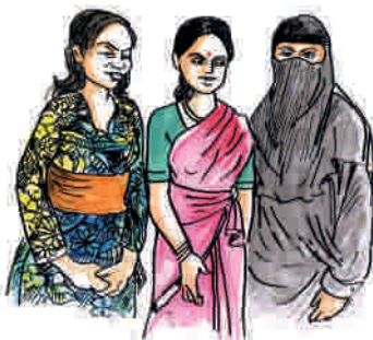
Fig. 20.3: You cannot vote if you are women

You read about beginnings of democratic government in England, USA, France in 17 th and 18 th centuries and about the most recent movements for democracy in Libya and Myanmar. The evolution of democracy has had many ups and downs. Popular rule was established and then it was overthrown and monarchies established. Even where popular rule was established it meant only the participation of a few people in electing the rulers. Slowly the meaning of democracy broadened and it developed many new layers and shades. At the same time it has also raised many questions which are not easy to answer. Let us consider some of these meanings and questions. Discuss the questions in the class room and also outside with your friends and relatives.