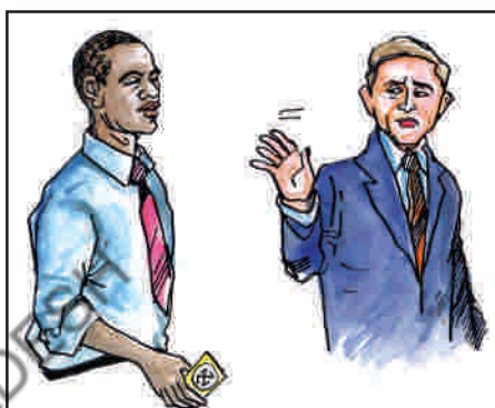
Fig. 20.4: You can't vote because you belong to different race