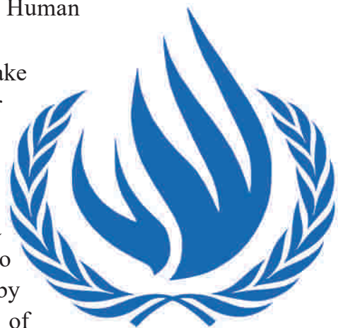
Fig. 21.5: Logo of Human Rights (United Nations)

NHRC is vested with the authority to make an inquiry, suo motu (on its own initiative), or on a petition presented to it by a victim or any person on his / her behalf. It intervenes in any proceeding involving any allegation of violation of human rights pending before a court with the approval of such court. It also makes and reviews the safeguards provided by or under the constitution for the protection of human rights and recommends measures for their effective implementation.