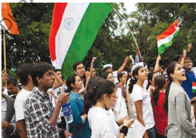
Fig. 21.2: A rally

However, there are some restrictions on this right – for example, any assembly should be conducted in a peaceful manner without the display or use of arms. Similarly, whenever a demonstration or a rally is organised, prior permission from the administration needs to be taken.