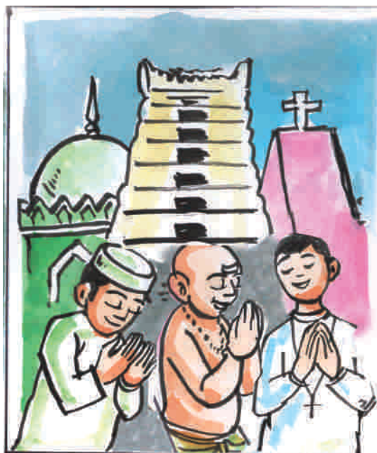
Fig. 21.3: Places of worship and people of different religions

All individuals are free to follow their conscience and practise any religion. No one can be prohibited from following his or her