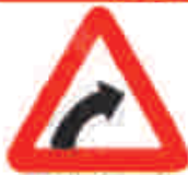
Right hand curve