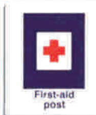
First aid post