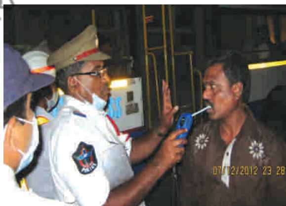
Fig. 24.1 What are the policemen doing?

How breath analyser works : When a person drinks alcohol it is absorbed in to the blood and is circulated through out the body. As this blood reaches the lungs, the air we exhale carries traces of alcohol which is measured by the gadget. In a way the exhaled air would contain alcohol traces along with Carbon-di-oxide. These machines can pickup even the slightest traces of alcohol. Police Officer can not delete the record in breath analyser even though he wants to help the victim.