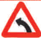
Left hand curve