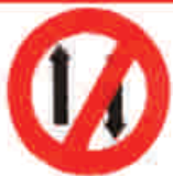
Vehicles prohibited in both direction