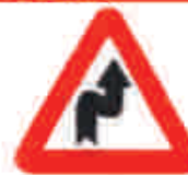
Right reverse bend