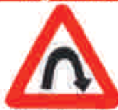
Right hair pin bend