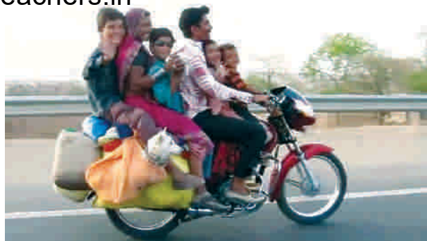
Fig. 24.2 : Dangerous to drive with overload