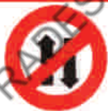
All vehicles prohibited