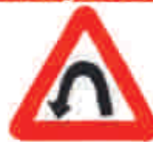
Left hair pin bend