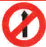
Straight Prohibited or no entry